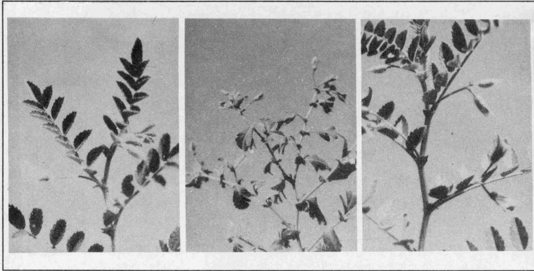
Fig. 1. ICCV 5 with white flowers (left), PRR 1 with simple leaves (center) and Annigeri DPM with twin flowers and twin-pods (right).

Center at three different sowing dates. The progenies were inspected in the 1987/88 postrainy season.