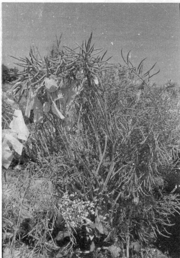
Fig. 3. Male sterile plant with normal pod setting under open pollination

A prerequisite for hybrid seed production is the ability of the CMS lines to have normal seed set under open pollinated conditions. Selected plants with normal or near normal floral characteristics had good seed setting under open pollinated conditions. (Fig. 3). The flowers were also frequently visited by honeybees since they had functional nectaries.